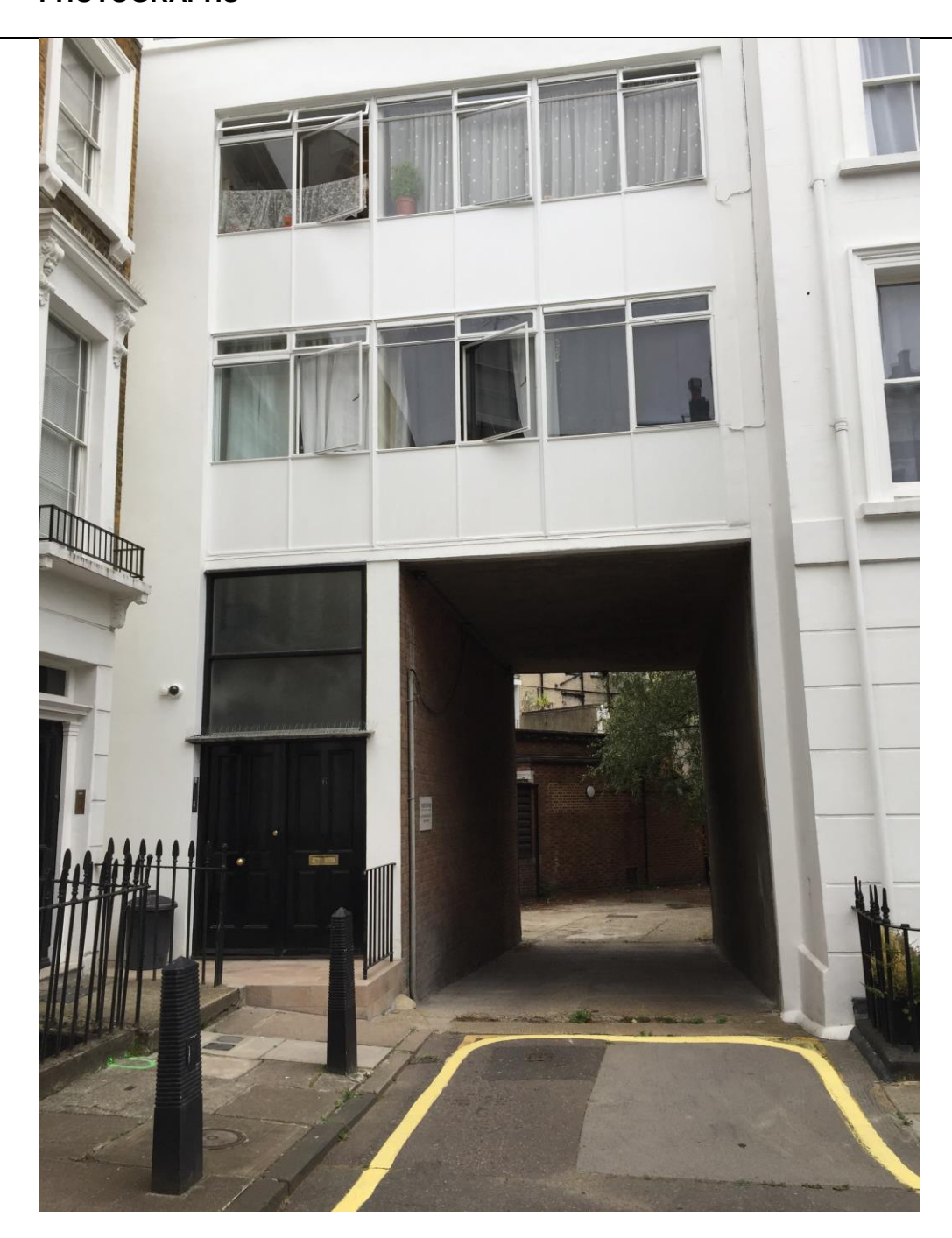
Proposed Gate Location: Front Elevation